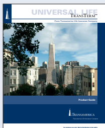
TransTerm Product Guide

For more details about TransTerm, click on the thumbnails below or contact Strategic Marketing at 866-545-9058.